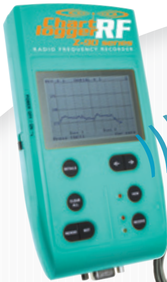
Recorder & Receiver shown smaller than actual size of 6 3/4"H x 3-3/8"W x 1 1/4"D